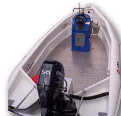
MAC 420 Console