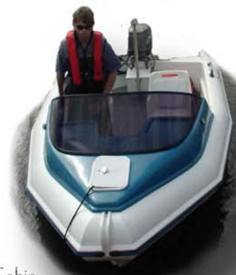
MAC 420 Sport Cabin