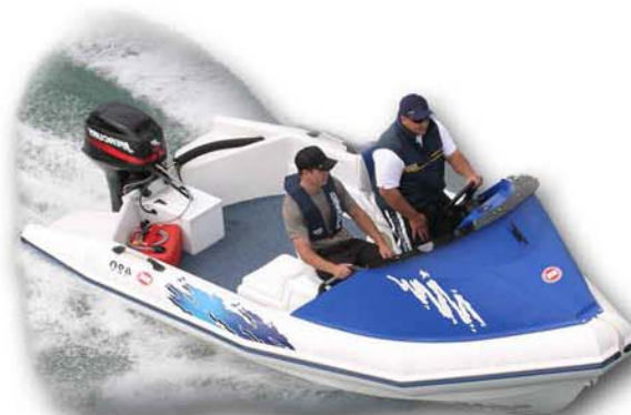
MAC 420 Cuddy Cabin