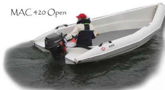
MAC 420 Open