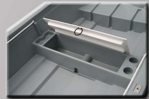
Central seat stowage locker